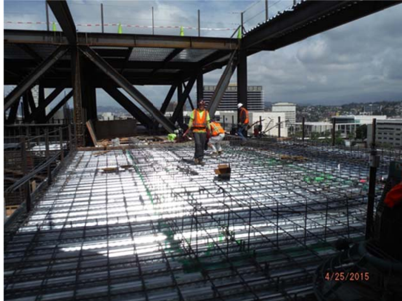
Penthouse Slab East