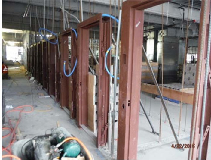
Detention Frames for Attorney Interview Rooms