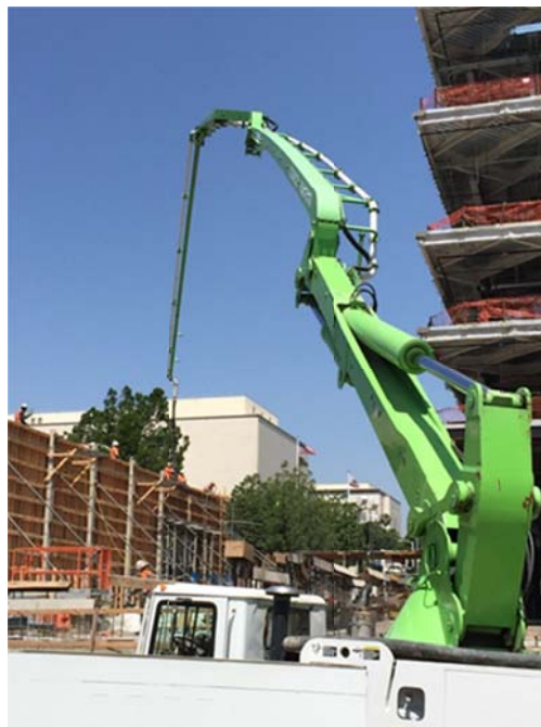
Placing Concrete for Sallyport Wall

Other structural related activities this month was the concrete placement for the perimeter Board Form wall at the Vehicle Sallyport and the wall form at the Jury Assembly area. Each had one wall completed and formwork continuing. These areas will receive much attention as we move into May. Other exterior wall activity is the installation of the finished Indiana limestone at the base of the building. This same material will eventually wrap into the main lobby to provide the finish for the interior walls.