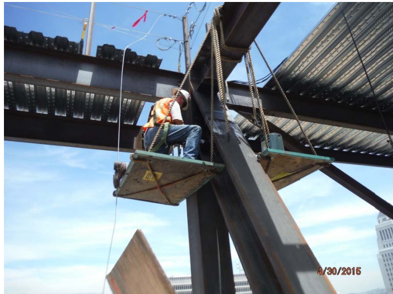
Steel Inspections at Roof Level