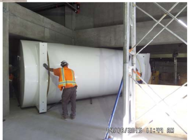
Emergency Generator (above) and Fuel Oil Tank

The Final Design Package 13 was issue by the Design-Build Team early in April. They are continuing to work on the design of the Government authorized Enhancements and will be preparing Design Bulletins for distribution of the applicable information.