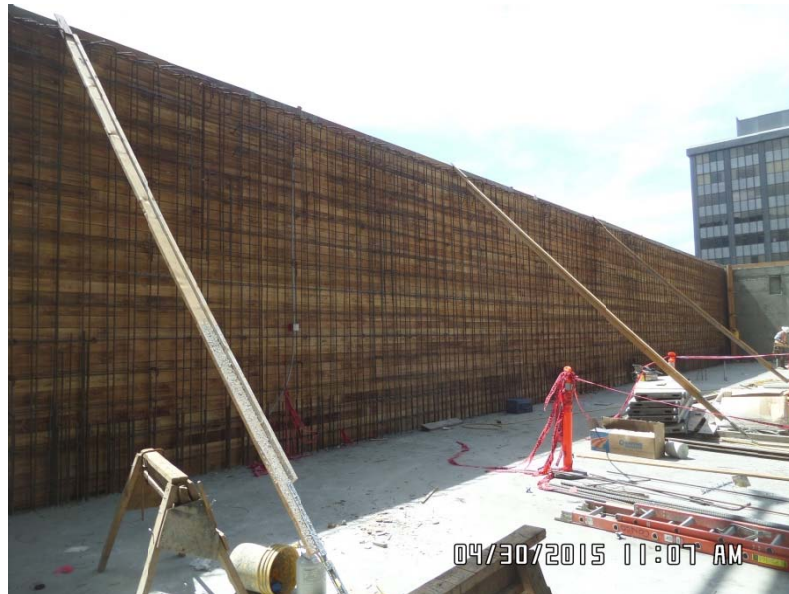
Board Form wall at Jury Assembly